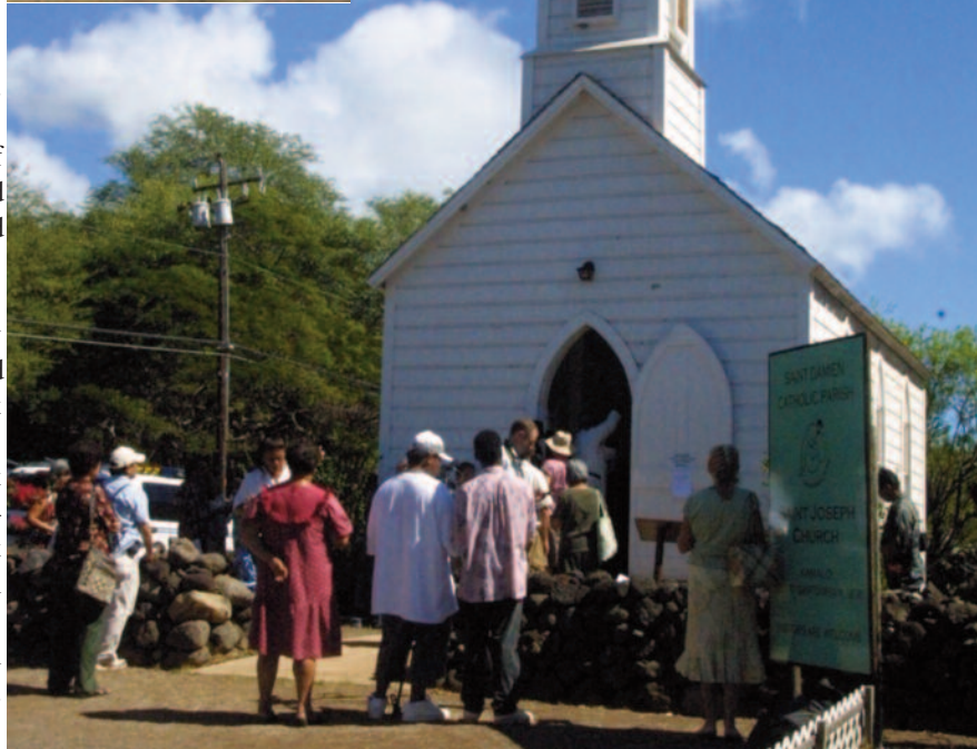
Top photo: Koa box containing St. Damien relic carried from St. Joseph Church following Midday Prayer, followed by Eucharist at Our Lady of Sorrows. Built by Damien in 1876, St Joseph Church is on the National Register of Historic Places.