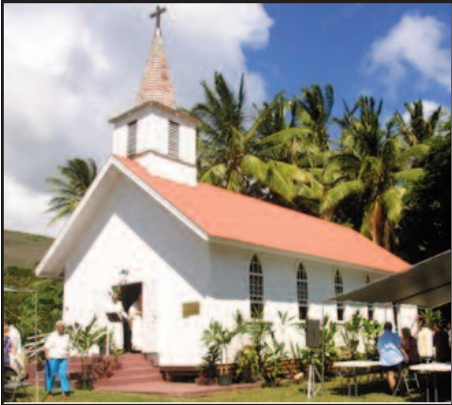
Photos: St. Joseph Church alter Damien built in 1876 with movable screen at top right of the communion rail which served as a confessional screen.