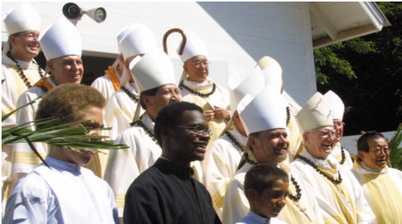
Below left: Bishops and altar boys paused briefly for a photo after services at Our Lady of Sorrows.