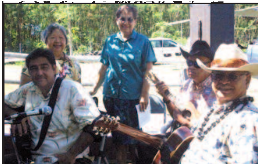
Molokai musicians added liturgy of song at Kaluaaha.