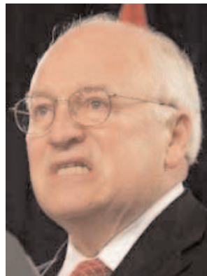
VP Dick Cheney