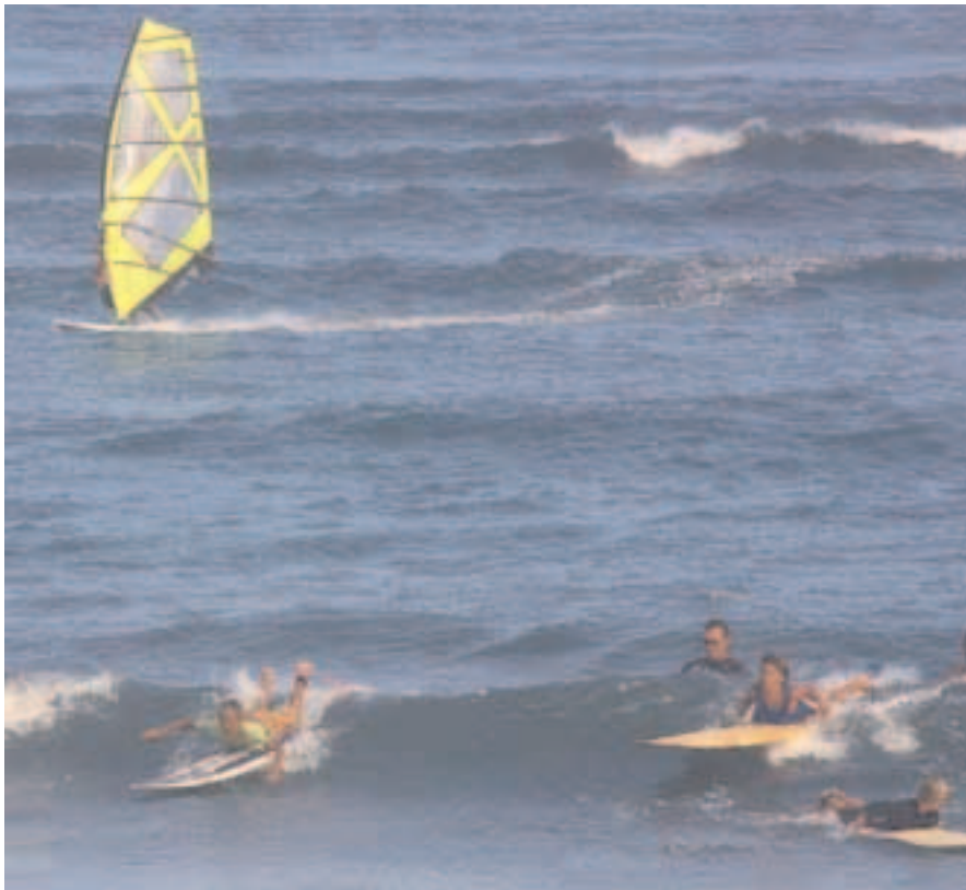
Last Saturday's Keiki Surf Meet at Waialua Beach had consistent keiki size waves throughout all the heats of contestants, and outside winds for windsurfers. July 11 is the final contest day. After that its all for Soul Surfers.