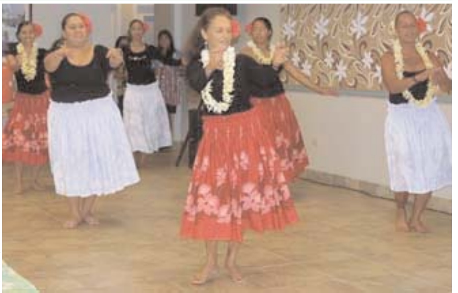
"Mele Ohana by Ritte Ohana