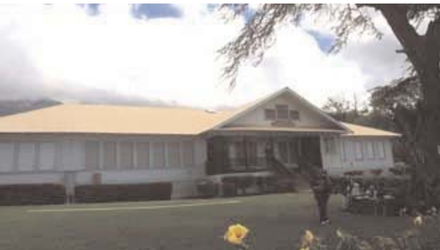
Kilohana Elementary School July 3, 2010