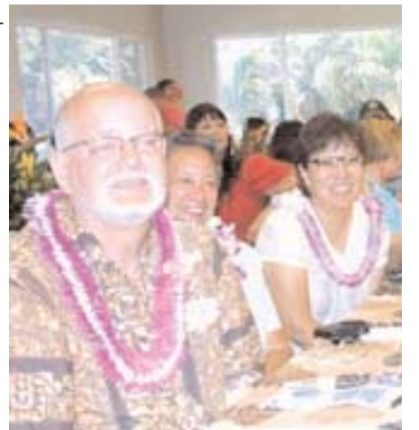
below: Arcadia Retirement Residence Team partners in the new facility